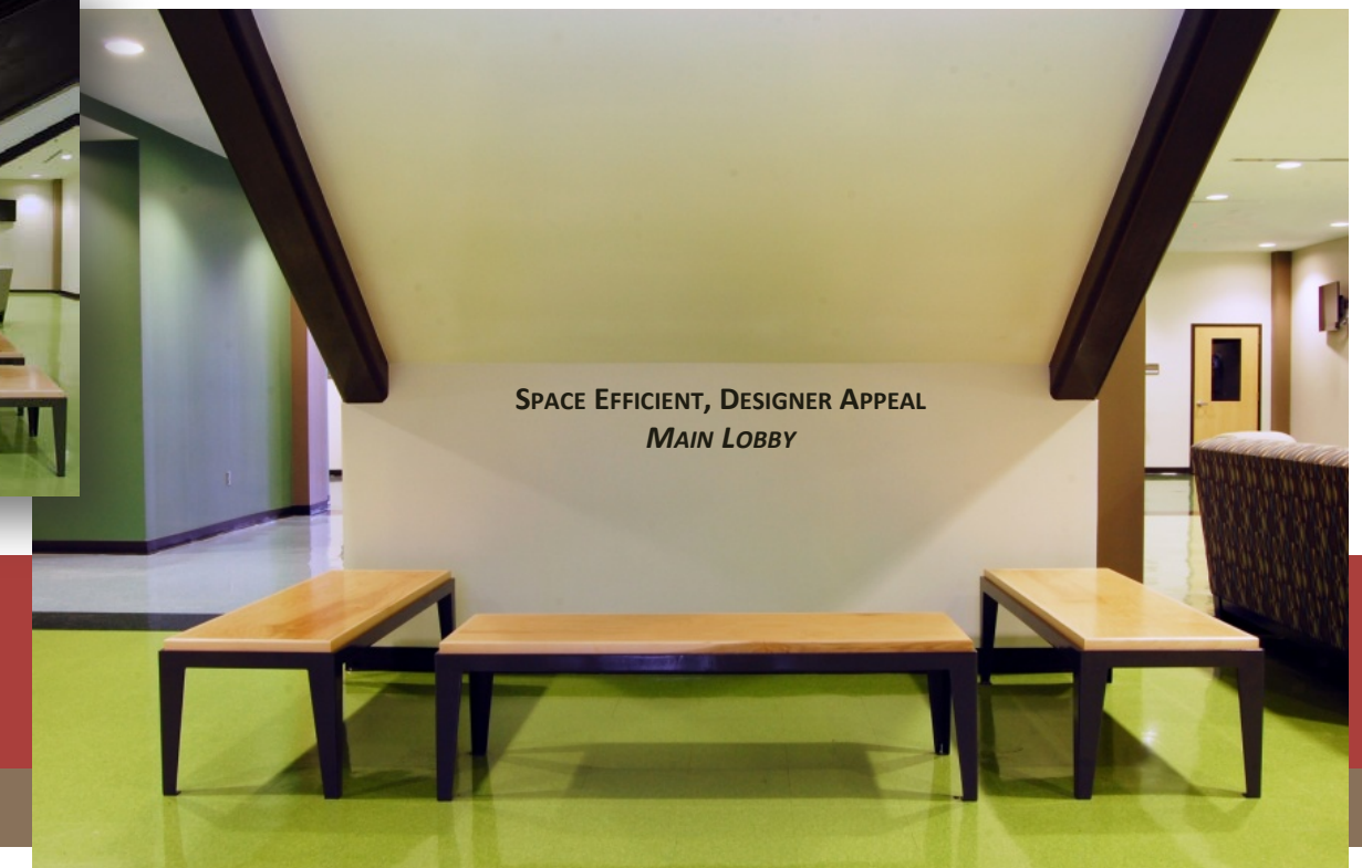
SPACE EFFICIENT, DESIGNER APPEAL MAIN LOBBY