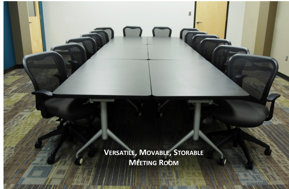
VERSATILE, MOVABLE, STORABLE MEETING ROOM