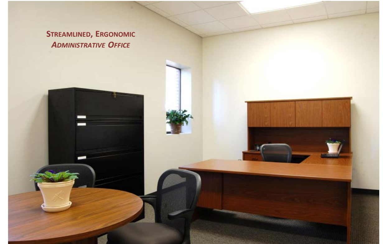
STREAMLINED, ERGONOMIC ADMINISTRATIVE OFFICE

GCI was selected to furnish specific areas requiring a balanced emphasis on form, function, versatility, and construction.