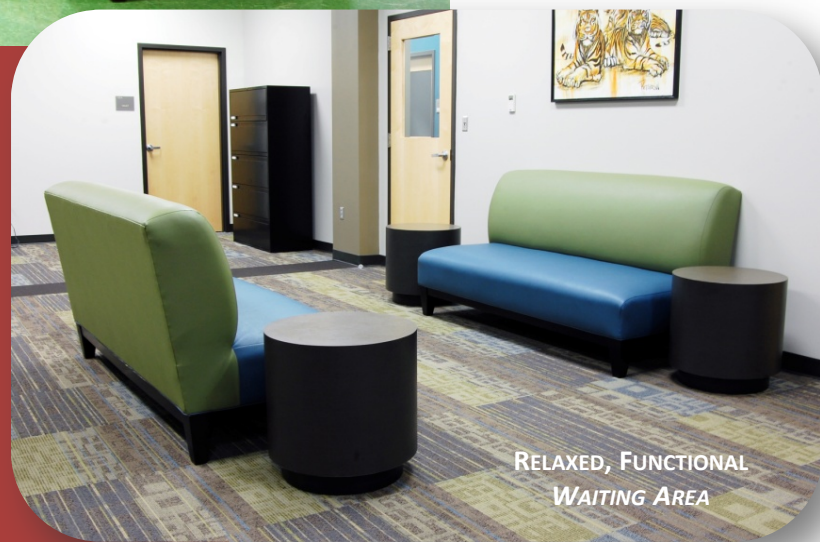
RELAXED, FUNCTIONAL WAITING AREA