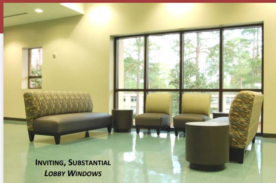
INVITING, SUBSTANTIAL LOBBY WINDOWS