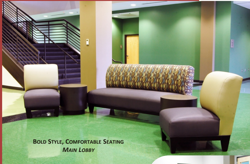
BOLD STYLE, COMFORTABLE SEATING MAIN LOBBY