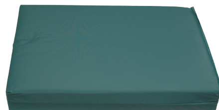
DP Core Pillow with Hunter Green Vinyl Cover, Sealed Seam