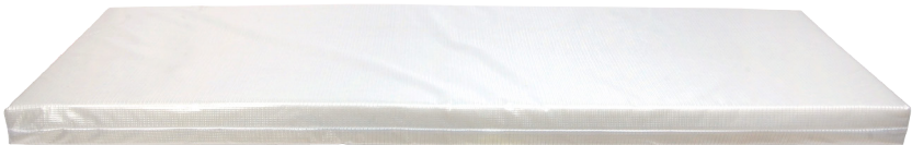
DP Core, Clear Vinyl Cover