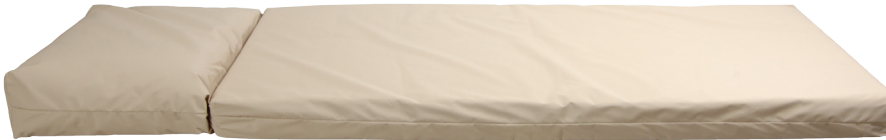
DP Core, Tan Vinyl Cover with Pillow