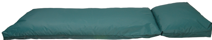
Cotton Core, Green Vinyl Cover with Pillow