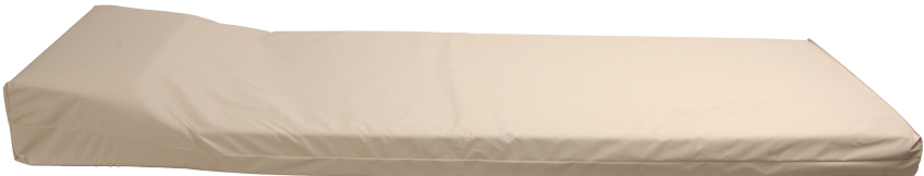
DP Core, Tan Vinyl Cover with Pillow