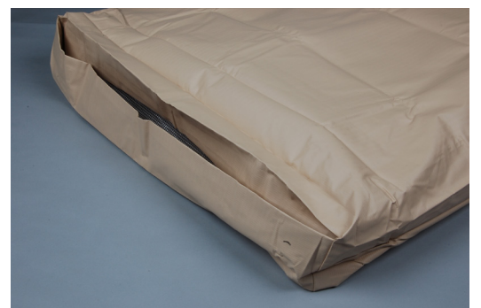
Vinyl Mattress Cover with Box Corner Flaps

Extend the life of your mattresses with GCI Mattress Covers!