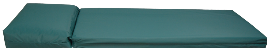
DP Core, Hunter Green Vinyl Cover with Pillow