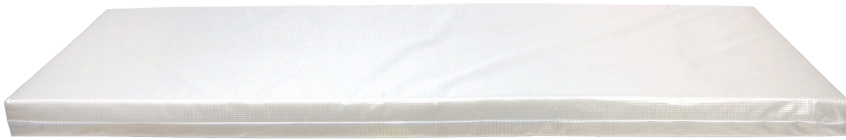
DP Core, Clear Vinyl Cover