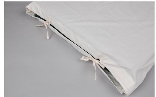
Natural Cotton Poplin Mattress Cover with Tie Closures