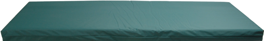
DP Core, Hunter Green Vinyl Cover