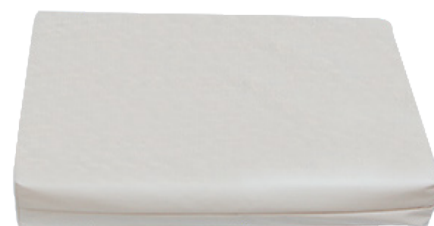
DP Core Pillow with Tan Vinyl Cover