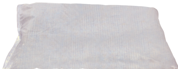
Cotton Core Pillow with Clear Vinyl Cover