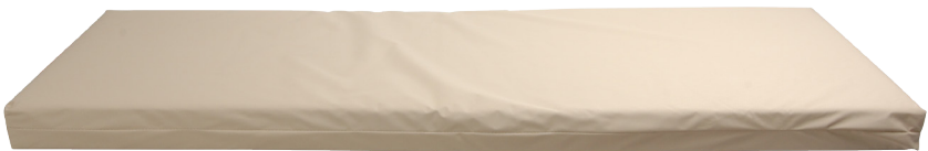
DP Core, Tan Vinyl Cover