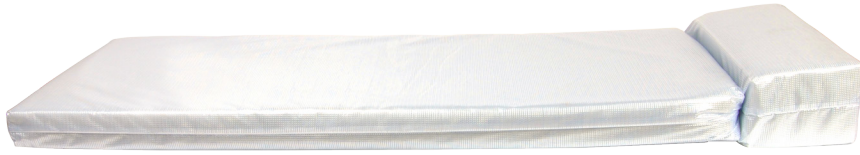
DP Core, Clear Vinyl Cover with Pillow