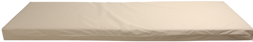
DP Core, Tan Vinyl Cover