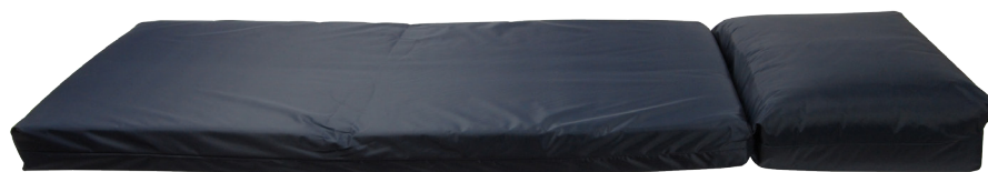
DP Core, Blue Nylon Cover with Pillow