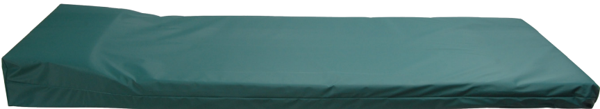
DP Core, Hunter Green Vinyl Cover with Pillow