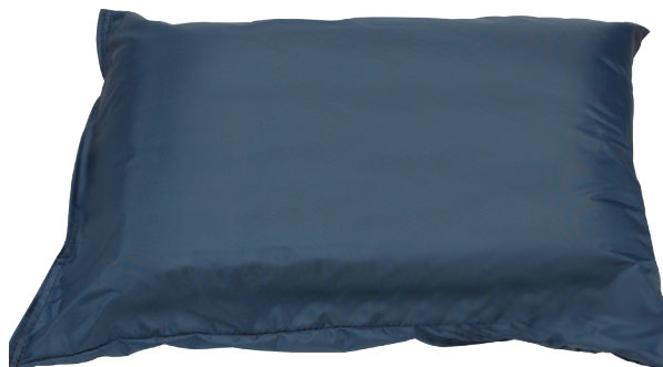
Cotton Core Pillow with Blue Nylon Cover