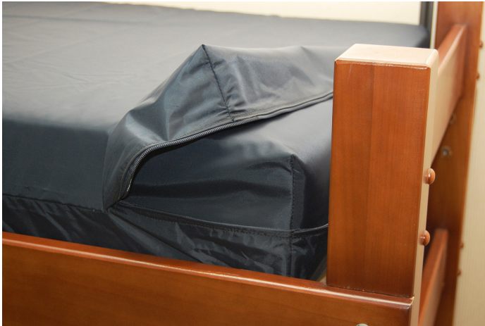
Coated Nylon Mattress Cover with Zipper Closure