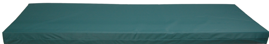
DP Core, Hunter Green Vinyl Cover