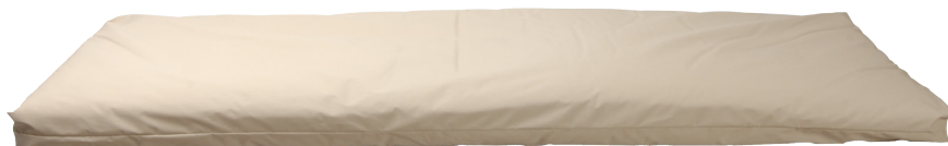
Cotton Core, Tan Vinyl Cover