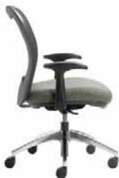
[ MXO 5900-CH ]